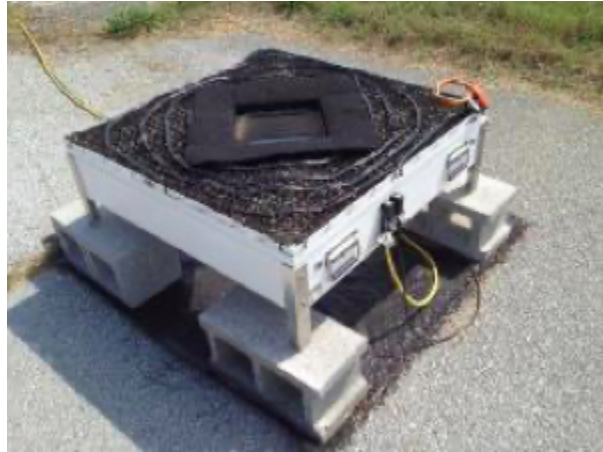
Figure 2: Image of the 2DVD instrument

Detailed shape and size information for each individual hydrometeor is available through the two “side image shadows” that are recorded by the two cameras. The light planes are separated by a calibrated distance of 6mm from which the vertical fall velocity can be measured. The line scan cameras sample each plane every 1 microseconds at a horizontal resolution of 200 microns. Therefore, as a raindrop falls through the measurement area, several line scans of each image are recorded from two sides and two different heights. This allows for precise measurements to be made. More information about the 2DVD instrument can be found in Kruger et al., 2001 .