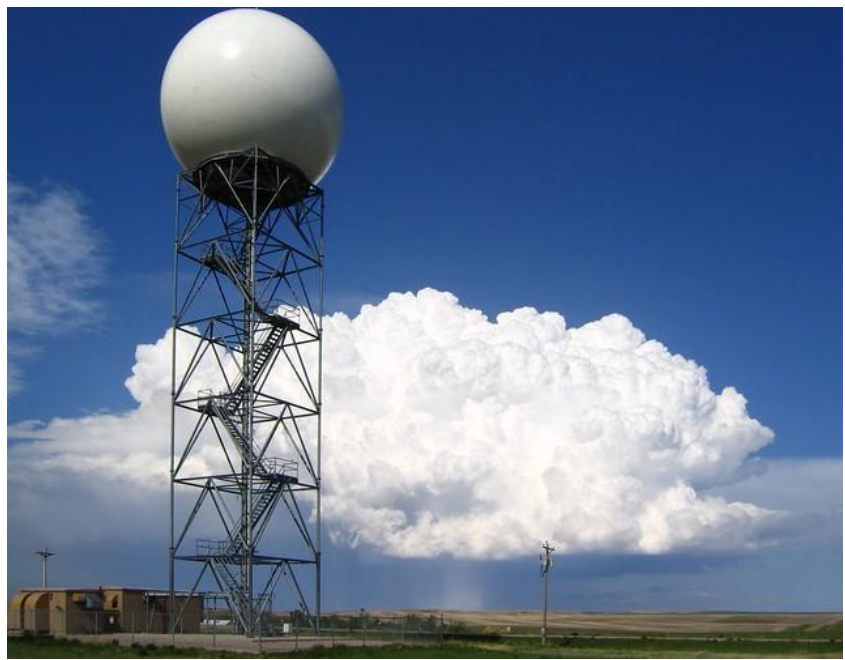
Figure 3: Image of NEXRAD radar site with an antenna tower and radome.

The NEXRAD Mosaic IMPACTS datasets include data from 30 NEXRAD locations separated into the East and Midwest Mosaic groups listed in Table 1 below: