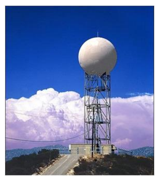
Figure 2: Image of NEXRAD radar site with antenna tower and radome.

More information about the WRS-88D NEXRAD system can be found in the Federal Meteorological Handbooks at the Office of the Federal Coordinator for Meteorological Services and Supporting Research (<u>http://www.ofcm.gov/publications/fmh/allfmh2.htm</u>) as well as from NOAA's Nationa Center for Environmental Information (NCEI) site located at NOAA (<u>https://www.ncdc.noaa.gov/data-access/radar-data/nexrad</u>).