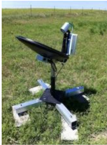
Figure 2: MRR used for GPM Ground Validation