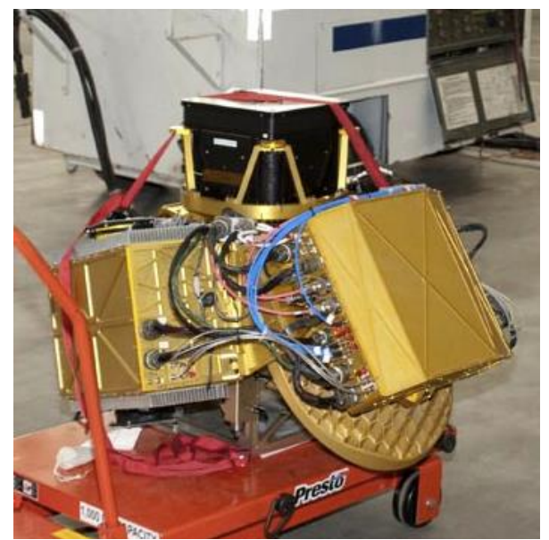
Figure 3: The High Altitude Wind and Rain Airborne Profiler (HIWRAP)