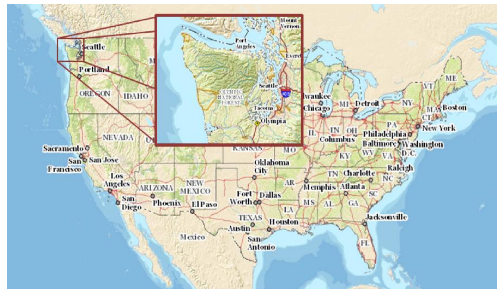
Figure 1: OLYMPEX Domain