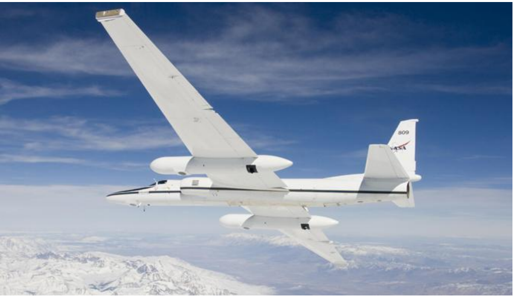
Figure 4: The NASA ER-2 high-altitude research aircraft