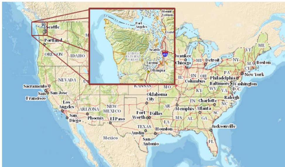
Figure 1: OLYMPEX Domain

One of the GPM Ground Validation field campaigns was the Olympic Mountains Experiment (OLYMPEX) which was held in the Pacific Northwest. The goal of OLYMPEX was to validate rain and snow measurements in midlatitude frontal systems as they move from ocean to coast to mountains and to determine how remotely sensed measurements of precipitation by GPM can be applied to a range of hydrologic, weather forecasting, and climate data. The campaign consisted of a wide variety of ground instrumentation, several radars, and airborne instrumentation monitoring oceanic storm systems as they approached and traversed the Peninsula and the Olympic Mountains. The OLYMPEX campaign was part of the development, evaluation, and improvement of GPM remote sensing precipitation algorithms. More information is available from the NASA GPM Ground Validation web site https://pmm.nasa.gov/olympex and the University of Washington OLYMPEX web site http://olympex.atmos.washington.edu/ .