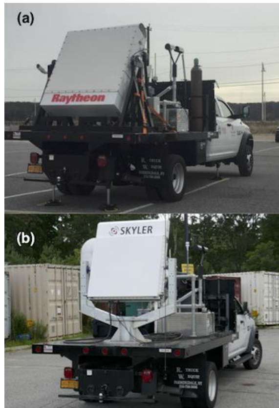
Figure 2: (a) SKYLER-I and (b) SKYLER-II on the SBU weather mobile platform.